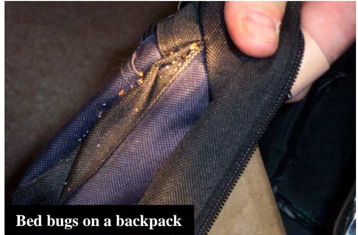
Bed bugs on a backpack

For more information regarding bed bug identification, behavior and control, please see the website: www.ipmctoc.umn.edu .