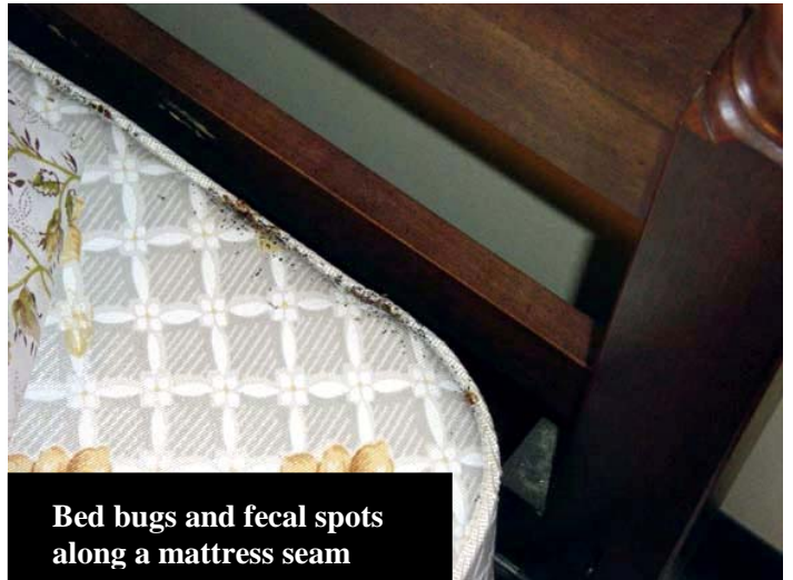
Bed bugs and fecal spots along a mattress seam