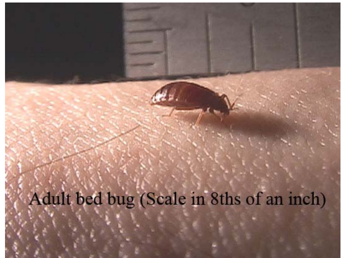
Adult bed bug (Scale in 8ths of an inch)

Students are strongly cautioned against “scavenging” beds and furniture that have seemingly been discarded and left by the curb for disposal, or behind places of business. Bed bug infestations are not limited to beds and mattresses, and they can be found on tables, drawers, and even electronics if these items were located in a bedroom or other place that could support an infestation.